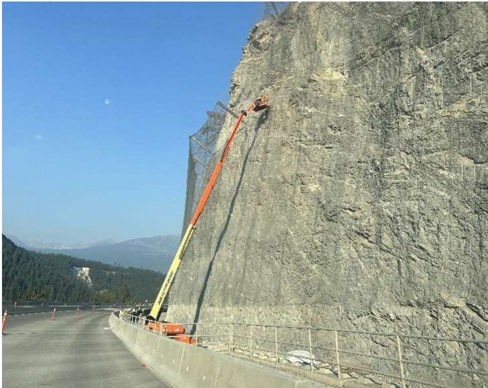
Figure 6: Adjusting rock attenuator fence at Cut 1 – July 23, 2024