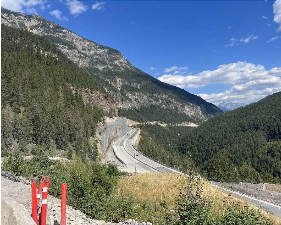
Figure 1: Highway open with no traffic restrictions – July 31, 2024