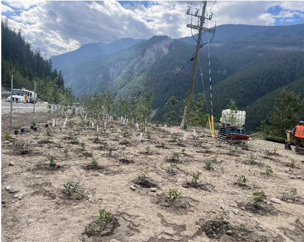
Figure 3: Tree planting at 5 Mile laydown area – July 31, 2024