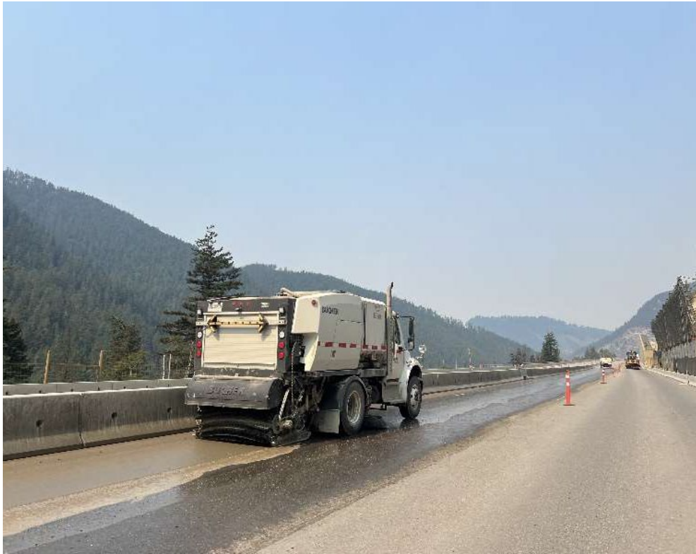
Figure 5: Cleaning road surface for line painting – July 24, 2024