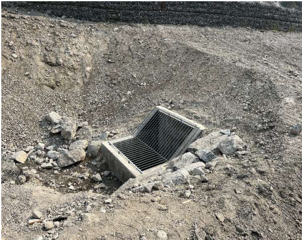
Figure 4: Inlet structure at Yoho Tie In nearing completion – July 26, 2024