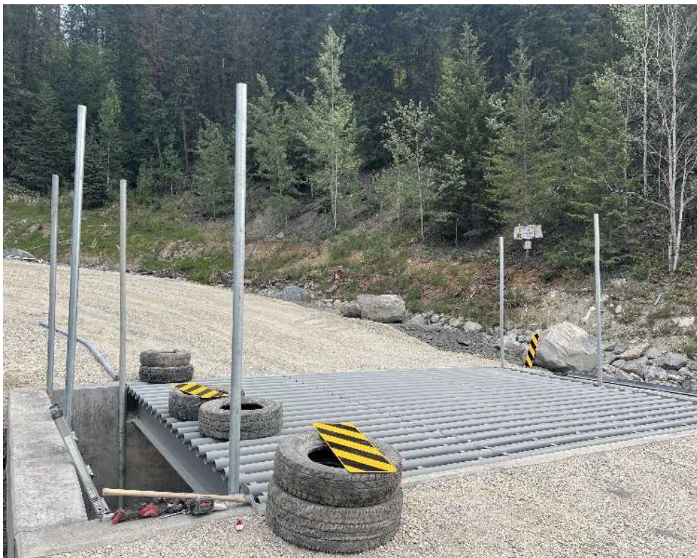
Figure 2: Installing wildlife fences at Dart Creek FSR ungulate guard – July 29, 2024