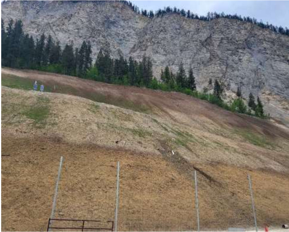
Figure 1: Hydroseeding complete at Pronghorn Cut – June 4, 2024