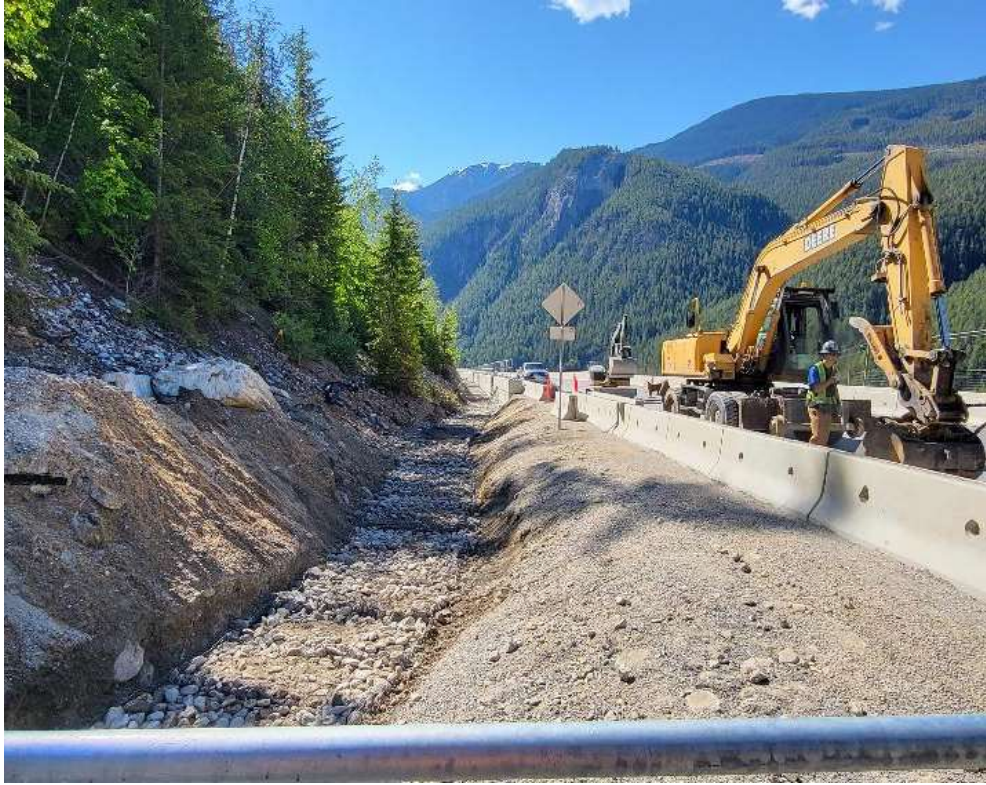
Figure 3: Ditch works at Caribou Wall area – June 21, 2024