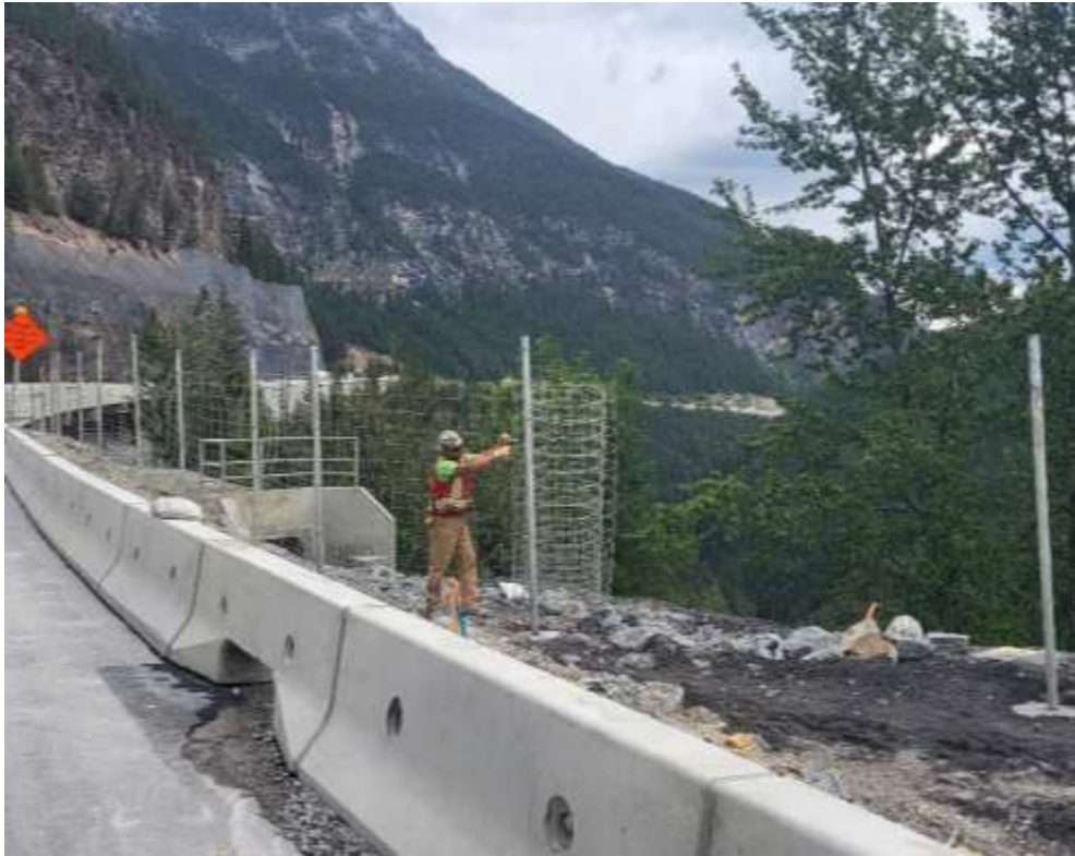
Figure 5: Wildlife Exclusion Fence at Cut 3 – June 19, 2024