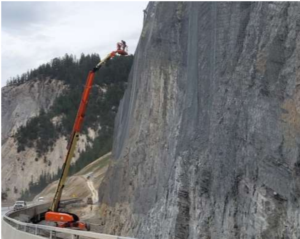
Figure 2: Cut 2 mesh adjustments – June 26, 2024