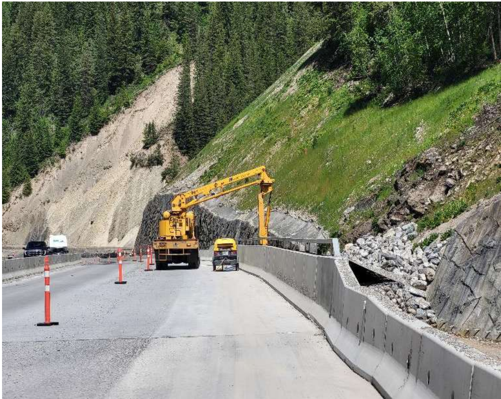
Figure 4: Snooper truck working at Marmot Viaduct – June 25, 2024