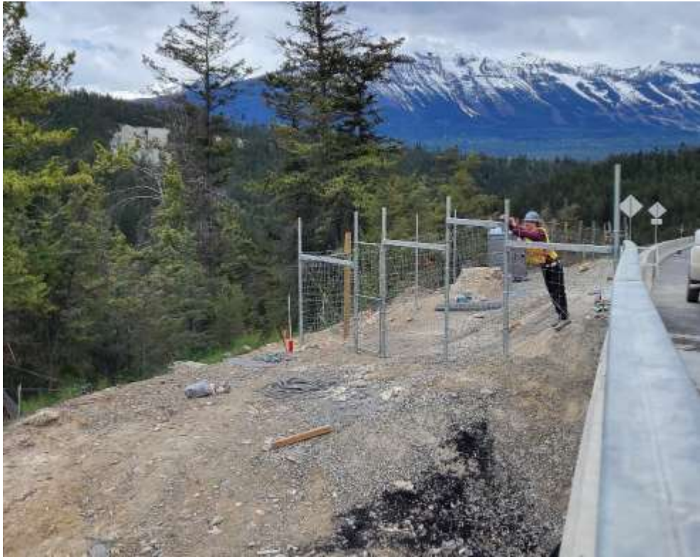
Figure 5: Wildlife Exclusion Fence at Sheep Bridge – May 30, 2024