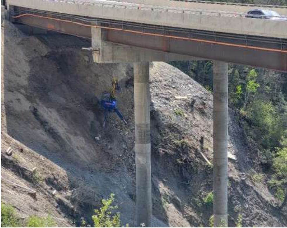
Figure 3: Spyder excavator performing slope work under Blackwall Bridge – May 11, 2024