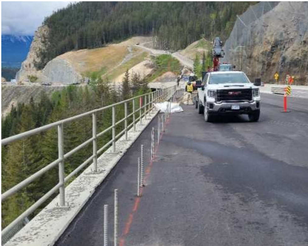
Figure 2: Installing Pins for barriers at Grizzly Viaduct – May 13, 2024