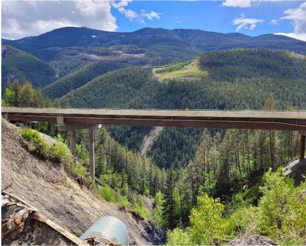
Figure 1: Blackwall Bridge – May 24, 2024