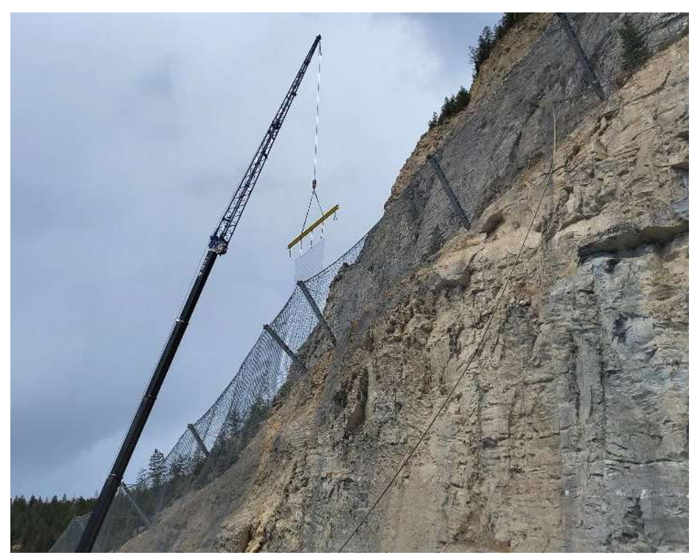
Figure 3: Cut #2 mesh installation ongoing – April 29, 2024