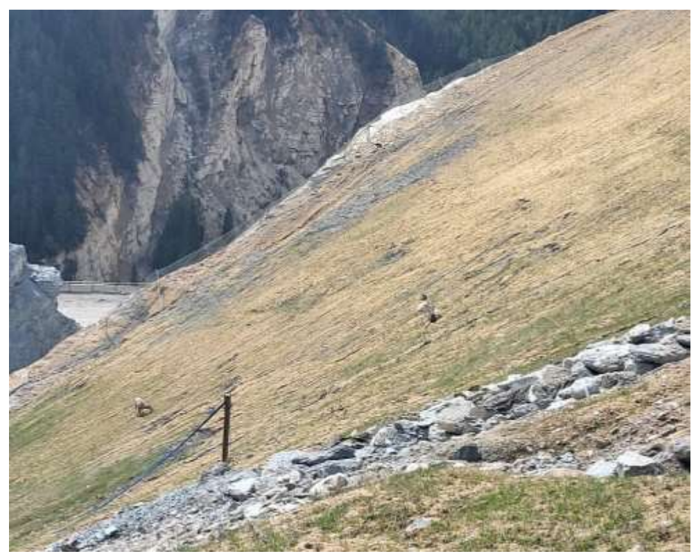
Figure 6: Bighorn sheep at Cut #3 – April 9, 2024