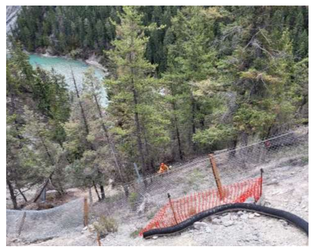
Figure 5: New snow protection fence installation ongoing – Sheep Bridge – April 24, 2024