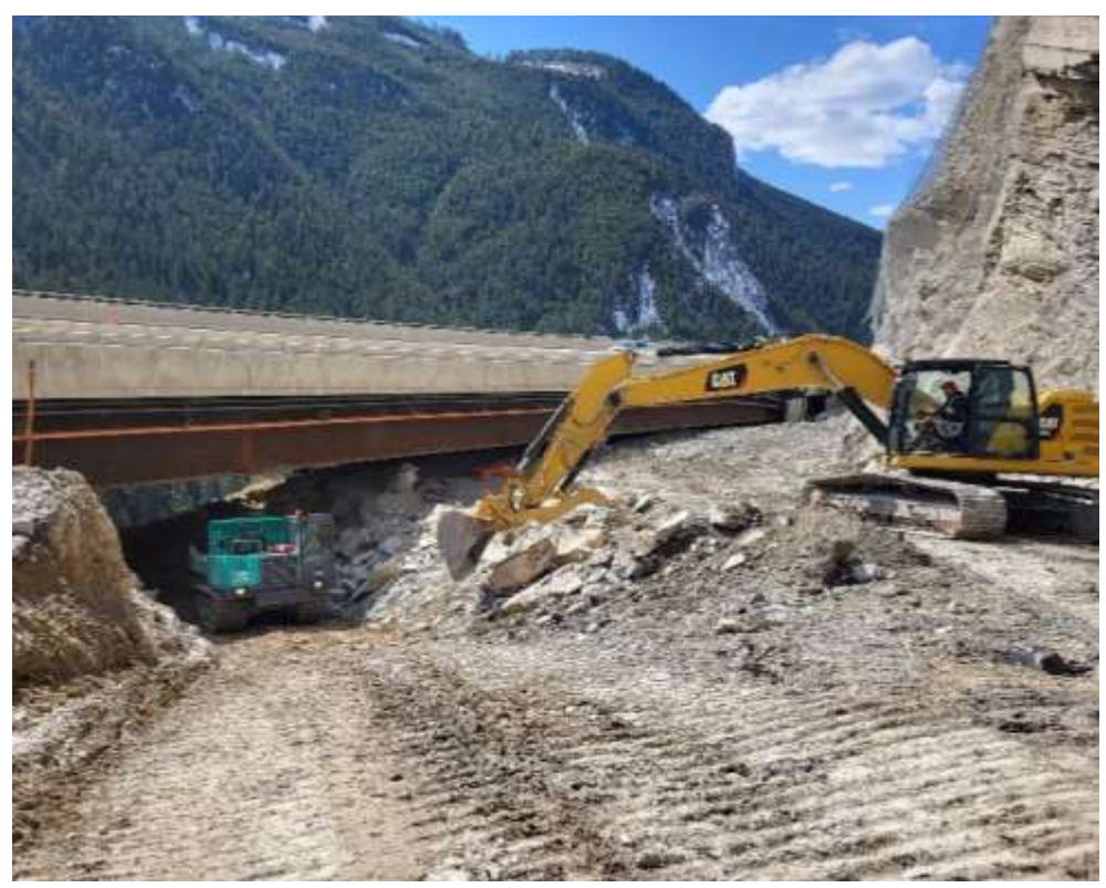
Figure 4: Access road pioneering at Frenchman's Bridge ongoing – April 18, 2024