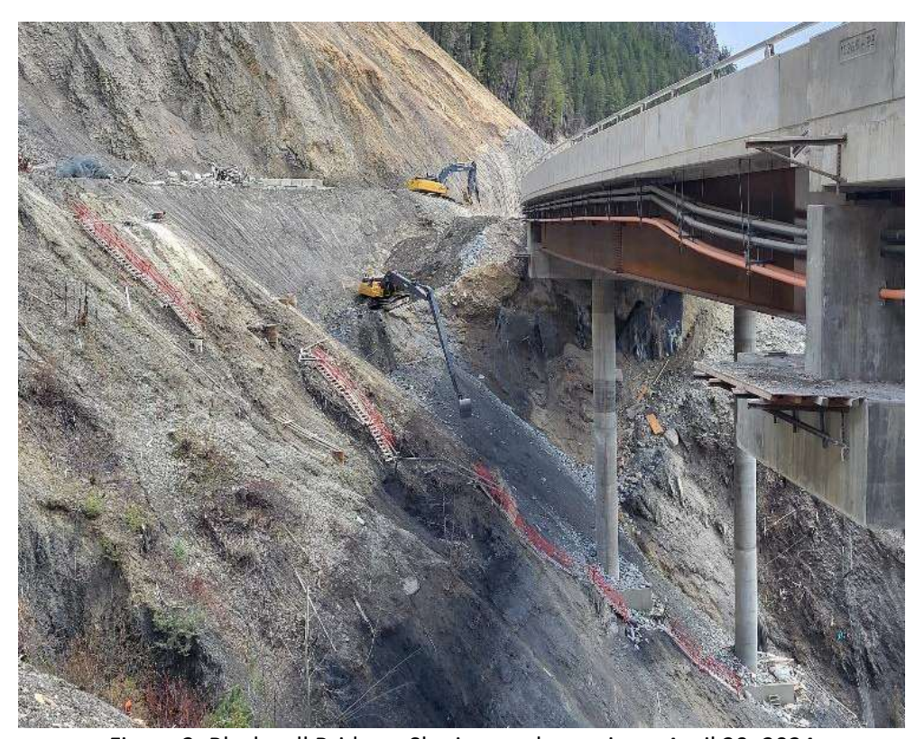
Figure 2: Blackwall Bridge – Sloping work ongoing – April 29, 2024