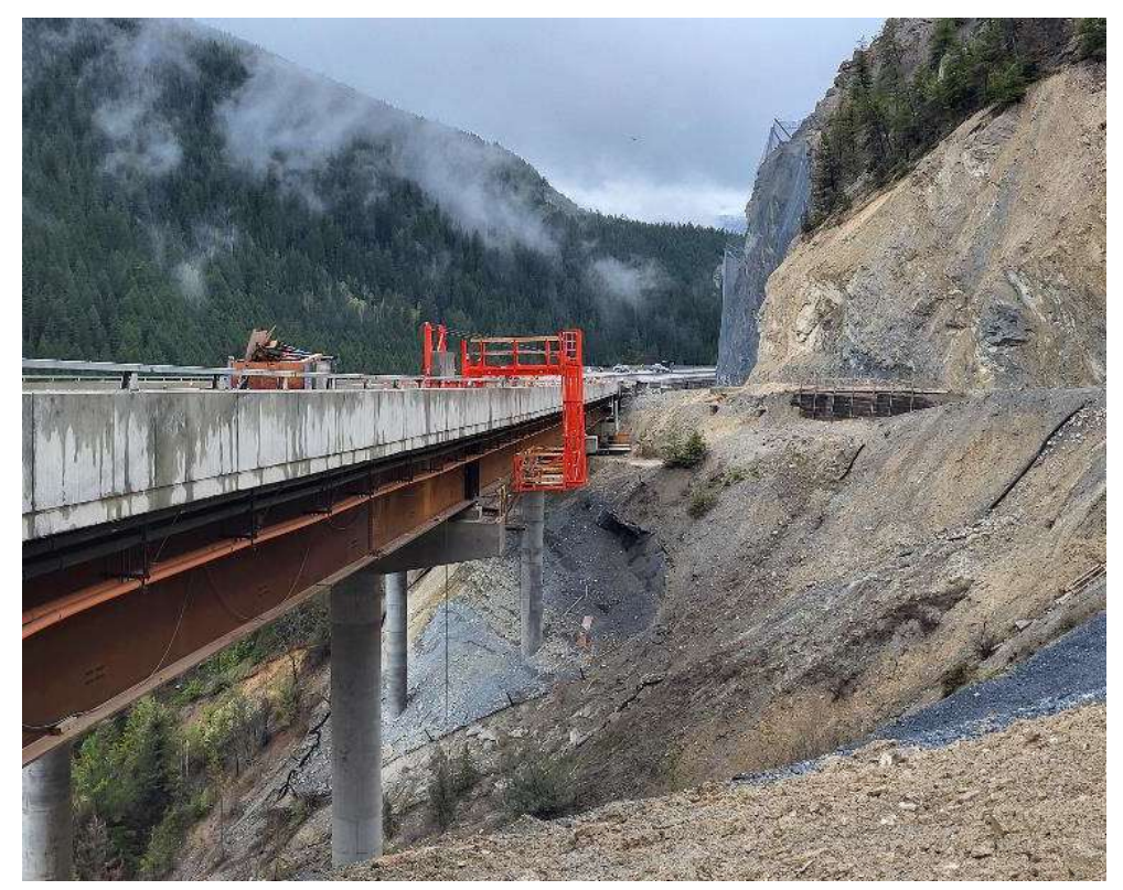
Figure 1: Removal of formwork at Big Horn Bridge near completion – April 26, 2024