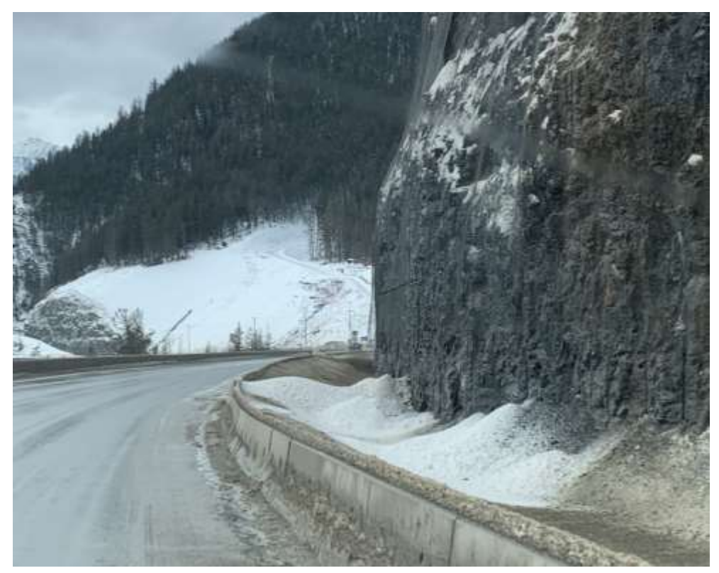
Figure 1: Snow accumulation in ditch along Grizzly Wall – March 2024