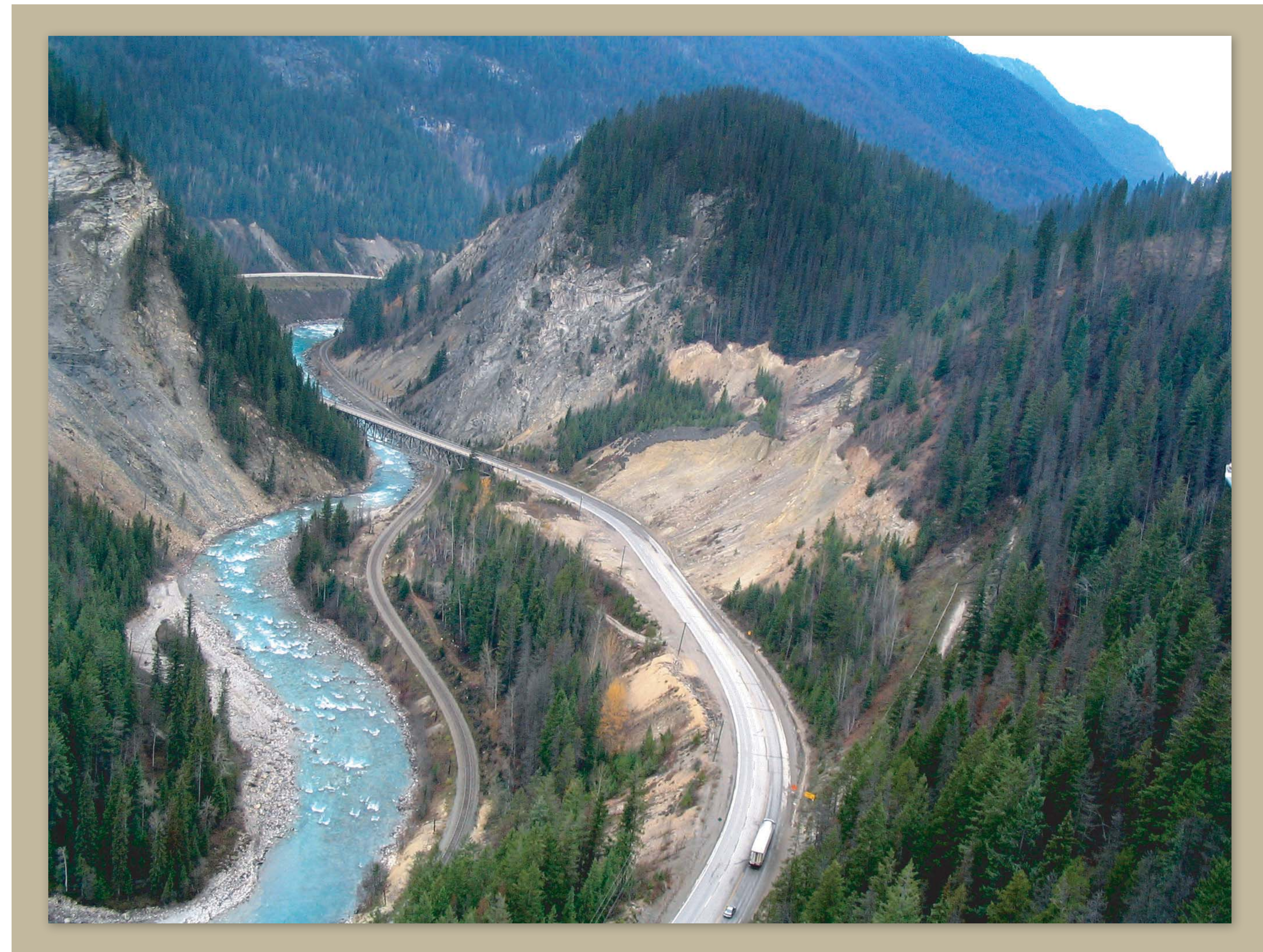
Aerial view of Park Bridge and its eastern approaches